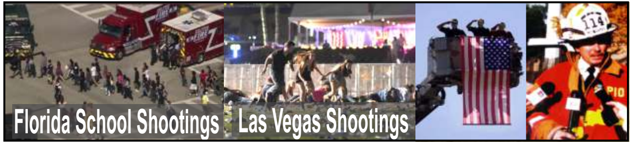
Florida School Shootings Las Vegas Shootings